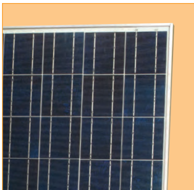
Solder-coated grid results in high fill factor performance under low light conditions.