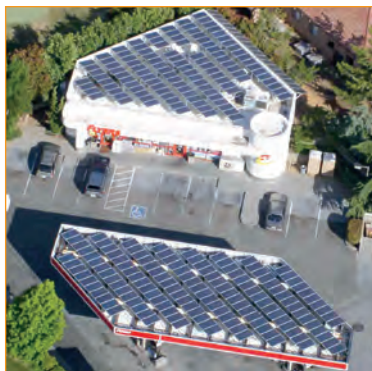
Sharp multi-purpose modules offer outstanding performance for a variety of applications.